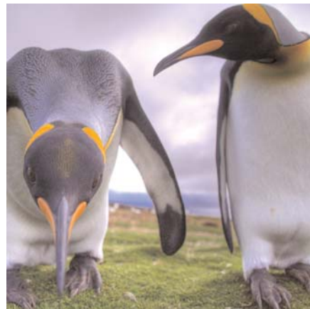
Curious King Penguins.

Let's return in due course to the somewhat nettlesome logistical question of how to reach the Falklands in the pre-