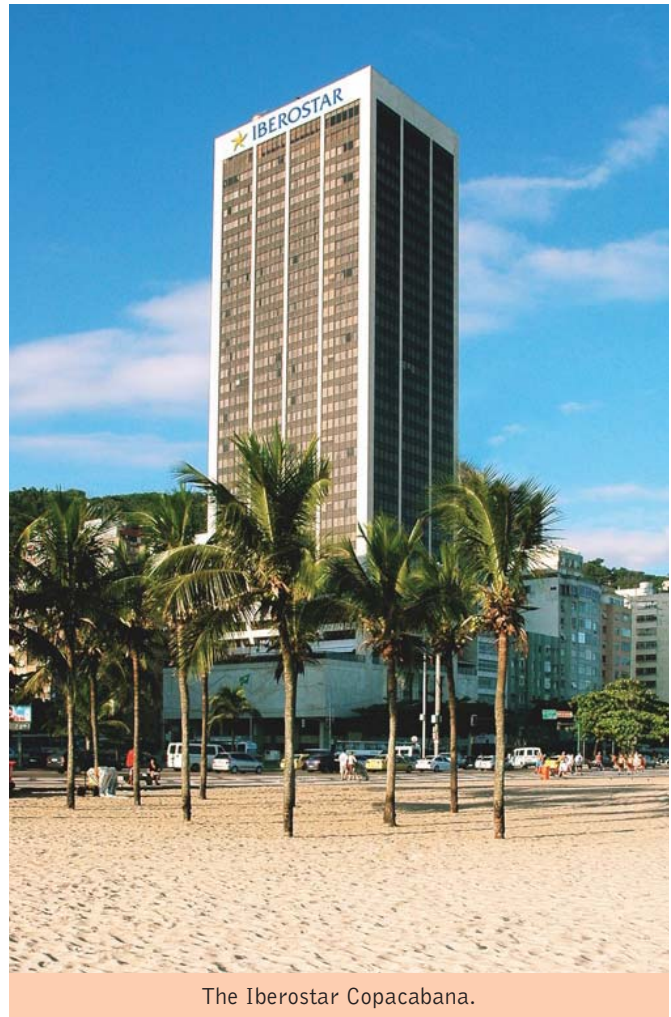
The Iberostar Copacabana.

Iberostar has two major properties in Brazil in addition to the Iberostar Copacabana. In the exotic northeastern state of Bahia, in a palm-shaded, and formerly fairly time-forgotten, oceanfront village partway from Salvador International Airport to the big resort complex at Porto Sauípe, the Iberostar Praia do Forte Golf & Spa Resort e Vilas has been operating for just over a year at a strength of 632 apartments, all with