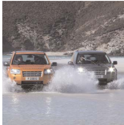
4-wheel driving on Paloma Beach.

How to get to the Falklands? Leaving out yacht charters and other such extravagant approaches, there are three options. One, you visit, as already suggested, in the course of a Southern