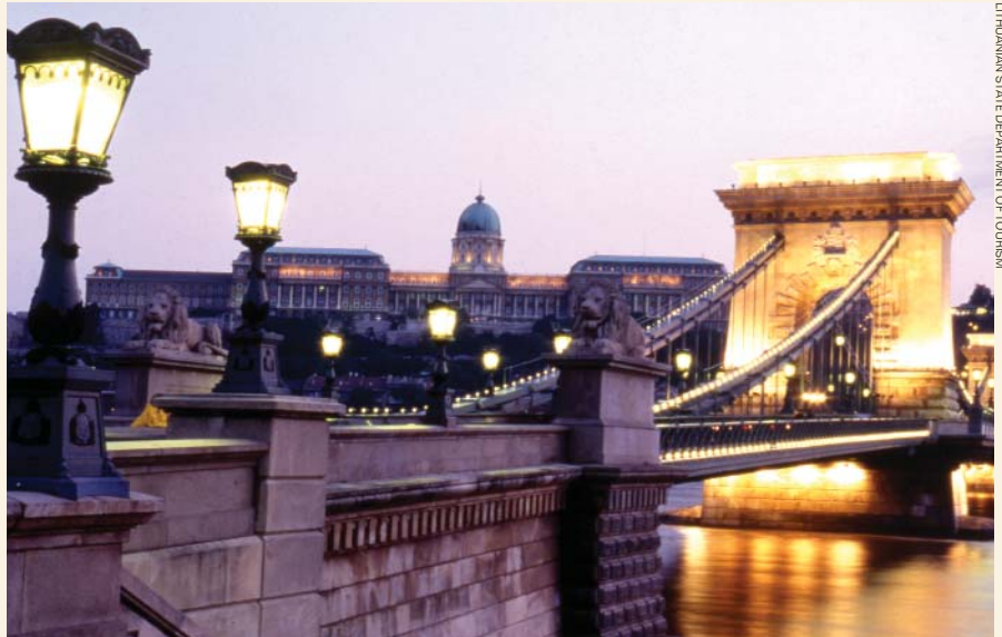
Chain Bridge with Royal Castle.

A member of the European Union since 2004, Budapest may be a city in