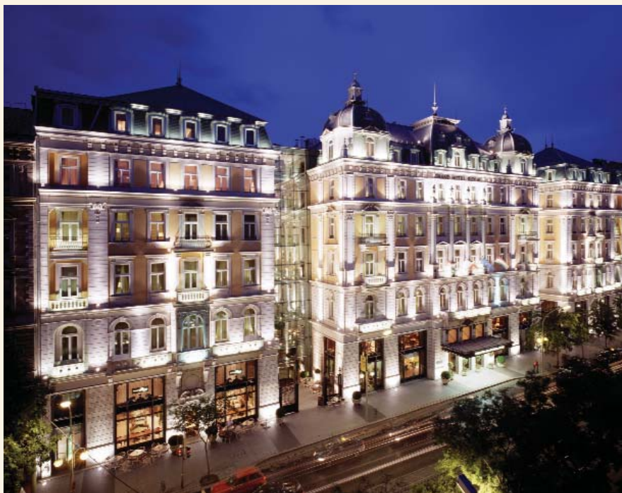
Corinthia Grand Hotel Royal.

Perhaps the only facet of Budapest city life that has remained unchanged for centuries is the embracing of water, massage and calibrated applications of heat and cold as remedies for health and well-being. Diehard believers think that the sulfurous minerals in the 120 natural springs serving the bath houses of Budapest can cure everything from