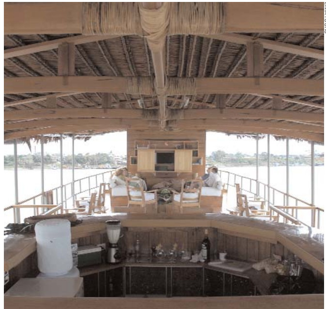
The Delfin Bar and Sundeck.

Peru, with its rugged and varied geography has always been host to innumerable cultures which have coexisted or fought, creating a cultural space that today contains evidence of centuries of human presence. All of it among nature at its most diverse, dominated by the Andes Mountain Range. What is surprising - and this perhaps identifies Peru - is that this history and nature continue creating life, life in which aspects of past cultures survive but are updated by the demands of the