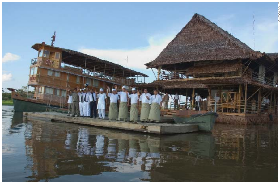
Local dockside farewell to the Delfin sailing.

Since the mid 1500's when Spanish conquistador Francisco de Orellana explored the entire length of it in search of "El Dorado," the fabled source of Inca