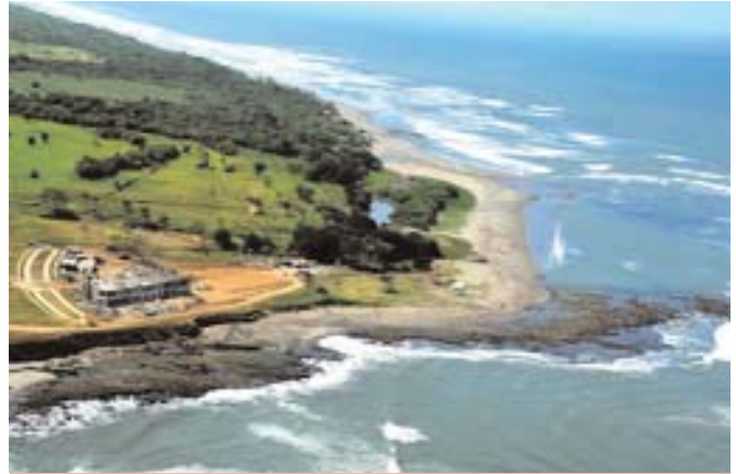
The Grand Pacifica Beach and Golf Resort, Nicaragua

Creating a lot of new interest in Nicaragua is a project to protect and bring home pirated petroglyphs to the island of Zapatera, one of the 300 islands in Lake Nicaragua (Lake