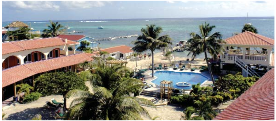
SUNBREEZE HOTEL AND SUNBREEZE SUITES

New for 2009 on Austin-Lehman Adventures' (ALA) list of iconic destinations for families is a nine-day/eight-night Panama Family: Reef & Rainforest Adventure with three departures scheduled