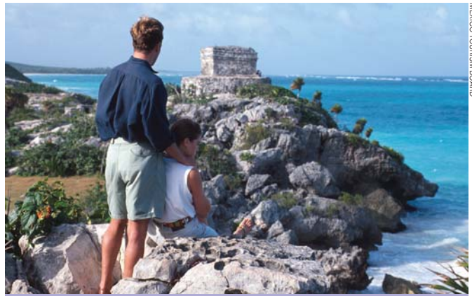
MEXICO TOURISM BOARD

New Orleans-based Nature Tours, Inc. customizes soft, eco- and cultural adventures throughout Mundo Maya; in Mexico specializing in Caribbean coast/Riviera Maya; land-only packages range from 3-day/4-night including Merida/Cancun airport transfer and hotel from approximately $400, to 9-day/8-night, $3,000 pp/do; air/land pack-