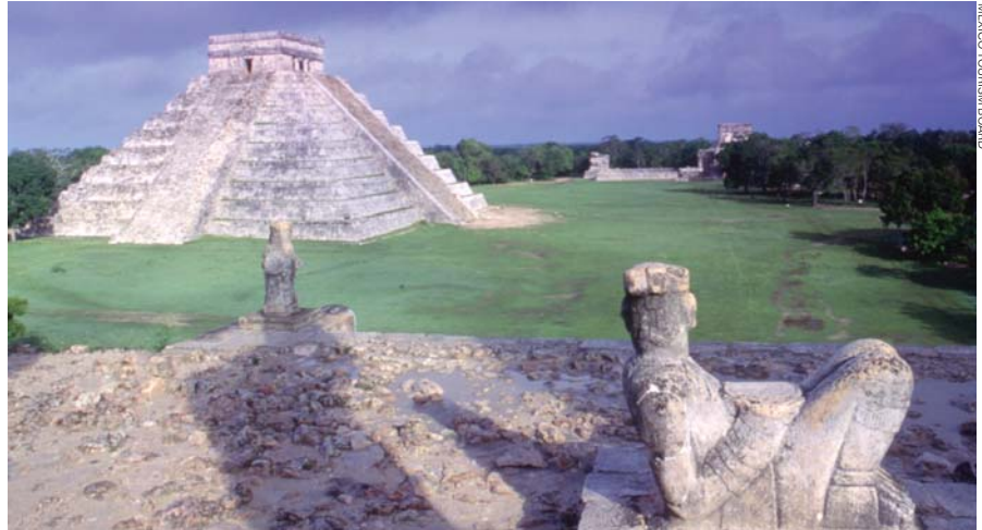
Iconic view of Mundo Mayan archaeological site of Chichen Itza.

The Maya are probably the best known of the classical civilizations of Mesoamerica. Originating in the Yucatan around 2600 B.C., they rose to prominence during their Classic period, 250-900 A.D., when the dynasty went into a mysterious decline until its close by 1200 A.D. Some peripheral centers continued to thrive until the Spanish Conquest in the early sixteenth century. While Europe was still in the Dark Ages, these clever and aggressive people were the first to evolve the only true writing system native to the Americas, develop the mathematical concept of