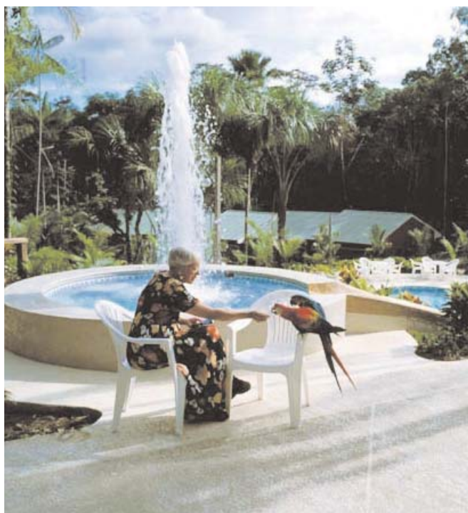
Co-mingle with nature at The Explorama Lodges.

For passengers in search of a soft-adventure version of the Amazon experience, a good option nowadays is the Ceiba Tops Lodge, Explorama's newest, at a distance of only about 25 miles from air gateway city of Iquitos. In addition to more nearly standard rooms, Ceiba Tops has suites designated Presidential and Ministerial, it has junior suites as well, a swimming pool, a water slide, elaborate gardens, and free wi-fi service. Air-conditioning? For sure. There are easy hikes nearby in the primeval forest, boat rides for dolphin spotting,