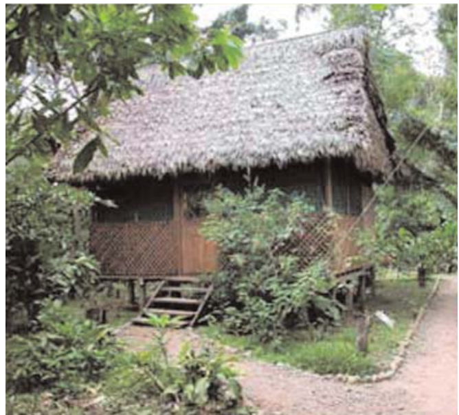
Manu Wildlife Center, one of many InkaNatura offerings.

The Pantanal Wildlife Center has ten double occupancy guest rooms, each with air conditioning, each with a hot-water shower and with space in the larger rooms for some extra single beds for visitors with children or for visitors otherwise not inclined to sleep side by side and, if the air-conditioning is not an absolute first among the still small number of lodges in the region, it must surely come close. The PWC