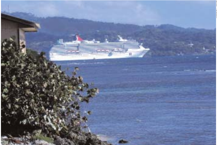
Carnival Cruise Line has embarked on a $50 million terminal at Dixon Cove, on Roatan's south shore.

Over the next two years the world's largest cruise ship companies will invest over $70 million in two ports on Roatan. Carnival Cruise Lines and Royal Caribbean are breaking ground on the most ambitious development projects ever undertaken on the island. Cruise ship arrivals are expected to quadruple.