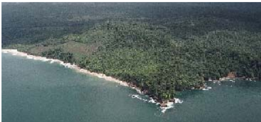
CUNA DE VIDA – ISLA DEL REY IN THE ARCHIPELAGO OF LAS PERLAS IN PANAMA

Del Rey Airport will have the ability to accommodate Boeing 737 business jets and will be a full-service international airport with a terminal building housing a luxury lounge, direct en-villa custom and immigration services, fueling services and resort ground transportation.