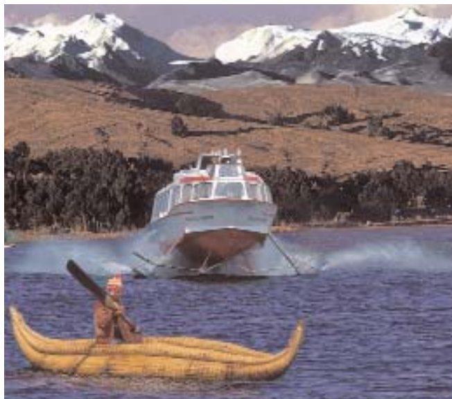
Crillon Tours started the Hydrofoil operation on Lake Titicaca.

TRENDS: New trends focus on adventure with comfort programs, and a wide range of special interests. Security, sanitary control and assertive information on the social and polit-