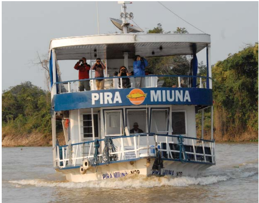
Jaguar Research Center boat makes its way in the vast Pantanal wetlands.

A story that caught the imagination of people here in the Rio de Janeiro area, where I live, in the last days of Carnival in February: Three American tourists, all guys, all in their 20s, went hiking in Tijuca Forest, larger, admittedly, by a considerable order of magnitude than London's Kensington