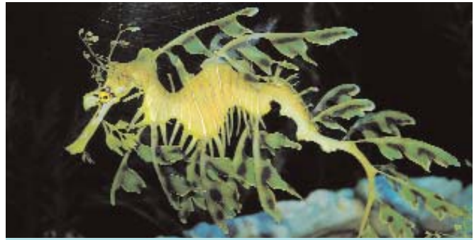
Wonders of Undersea Camouflage: Sea Dragon, Birch Aquarium at Scripps Institute for Oceanography.

The La Jolla Playhouse, founded in 1947 by Gregory Peck, Dorothy McGuire and Mel Ferrer, today serves as the debut theatre for shows that are Broadway-destined. The quality of its production and the professionalism of its artists set it apart from imitators. Gregory Peck, who had attended La Jolla