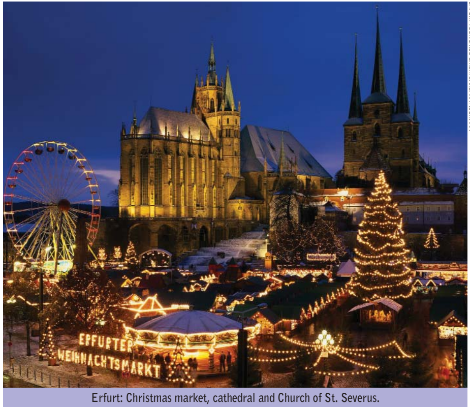
Erfurt: Christmas market, cathedral and Church of St. Severus.

Munich's traditional Christmas market, with roots going back to the 14th century, is held on Marienplatz square. The