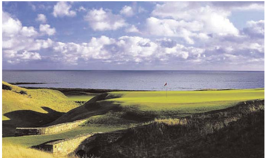
Kingsbarns Golf Links.