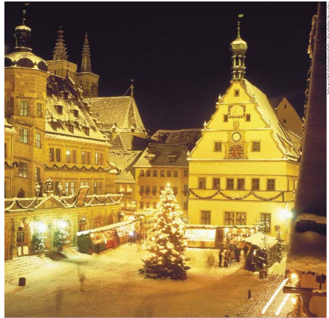
Rothenburg ob der Tauber: Christmas market with pretty lights.

Visitors will be thrilled about Germany's castles and palaces that are all original. There is not just a handful of well-preserved ones, but several thousands from all epochs and of every genre. They sit on hilltops in mountainous regions, are surrounded by water on the northern plains, or stand majestically next to modern architecture in city centers. Most of them have beautiful parks and gardens, and some even received UNESCO World Heritage status. Many of them host museums, concerts, medieval festivals, wedding celebrations, and other special events. Others have been converted into beautiful five-star hotels, unique bed and breakfasts, or fun youth hostels. Take a trip along Germany's Castle Road between Mannheim and Bayreuth to experience some of the 70 impressive castles, palaces and gardens along the route. Or follow Germany's most famous scenic drive, the Romantic Road. Highlights include medieval Rothenburg, the Rococo