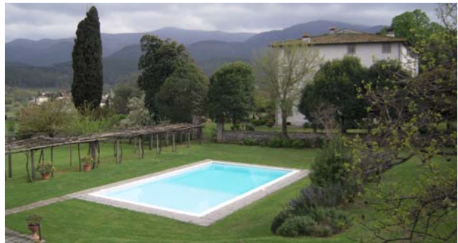
The gardens and swimming pool at Villa Buonvisi, an ancient and noble villa available to rent through Doorways, Ltd.