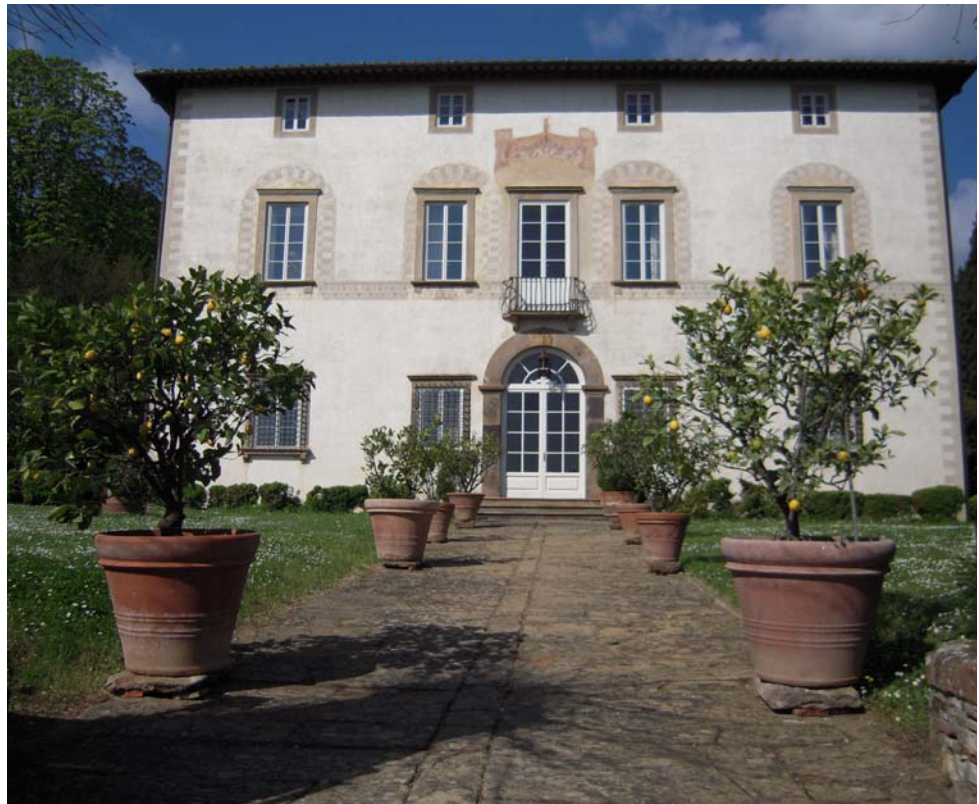
The Villa Buonvisi, is perched high on a Tuscan hillside overlooking miles of olive groves and vineyards.

The largest inventory is in Italy, and their largest audience is families where two or three generations can holiday together on one large property. With a local English/Italian