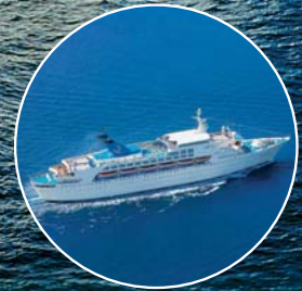
The Aegean Pearl

For Louis Cruise Lines brochure and information send e-mail request to: LCLUSA@louiscruises.com or visit www.louiscruises.com