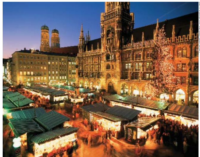
Munich: Christmas market by the City Hall.

Wieskirche Pilgrimage Church and, of course, world-famous Neuschwanstein Castle.